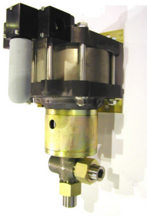
GSF25 (L) single acting, single air drive head with di- stance piece (Standard= Bottom inlet)